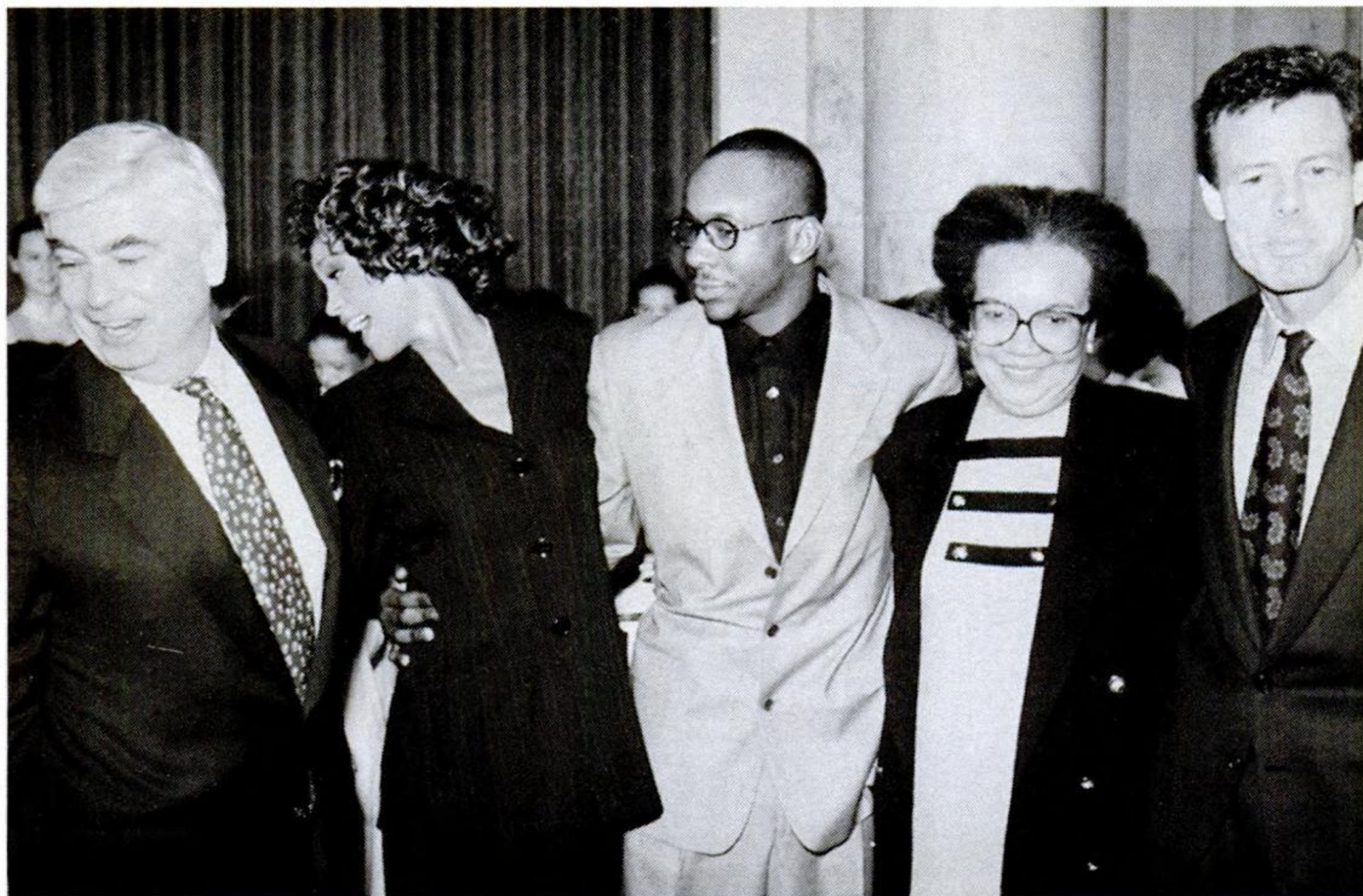
▲ Joining Houston and Edelman in a show of support for the concert, which launches the 25th anniversary of the Children's Defense Fund, are (l-r) Sen. Dodd, Bobby Brown, Houston's husband, and HBO Chairman and CEO Jeff Bewkes.