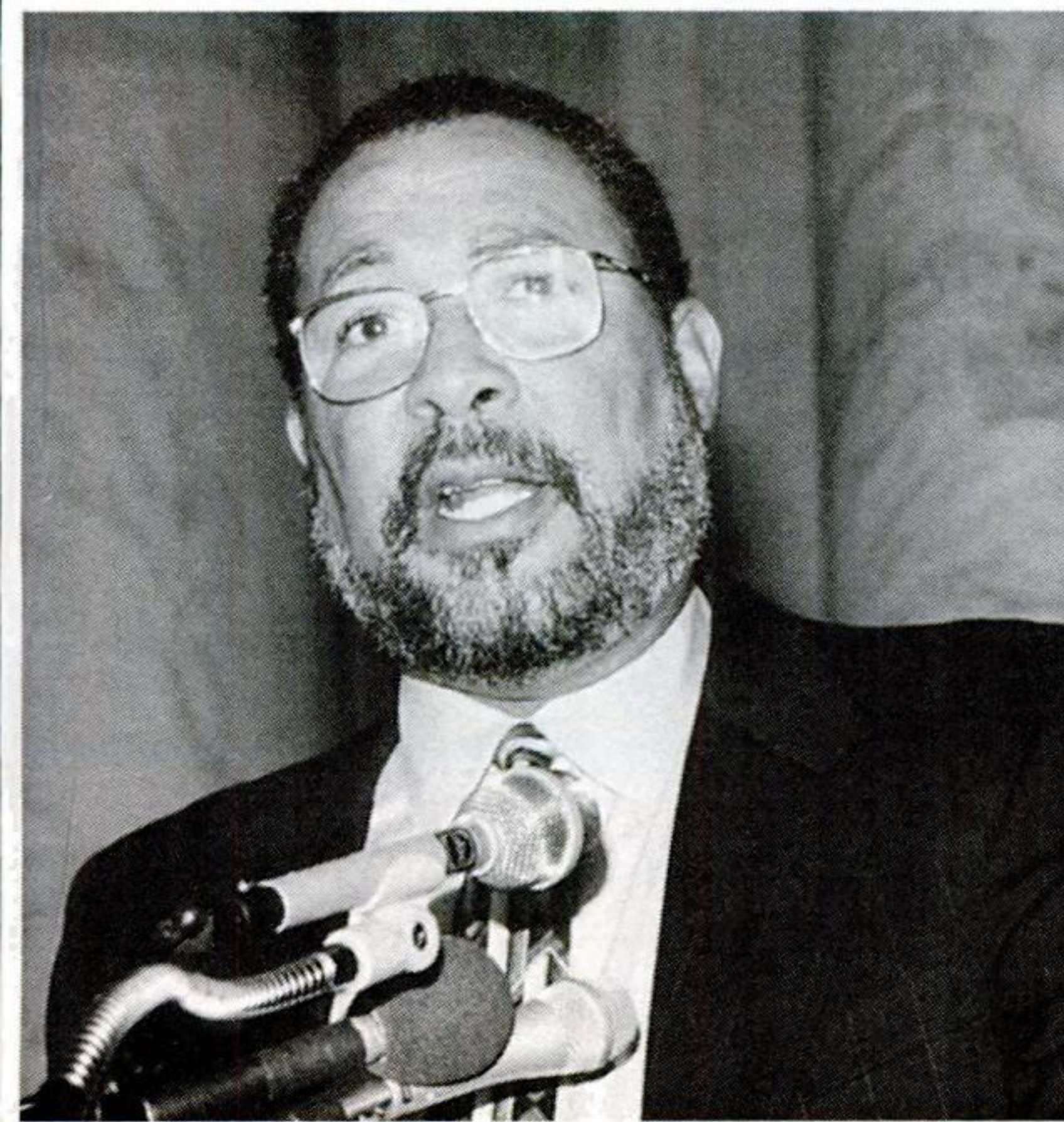
▼ Time Warner President Richard Parsons (l) and U.S. Sen. Christopher J. Dodd (D-CT), a longtime supporter of children's rights, address the press about the concert. Parsons presented a check in the amount of $50,000 to Edelman to assist in the organization's efforts.

"Whitney's effort, through this concert, shows strong support of our