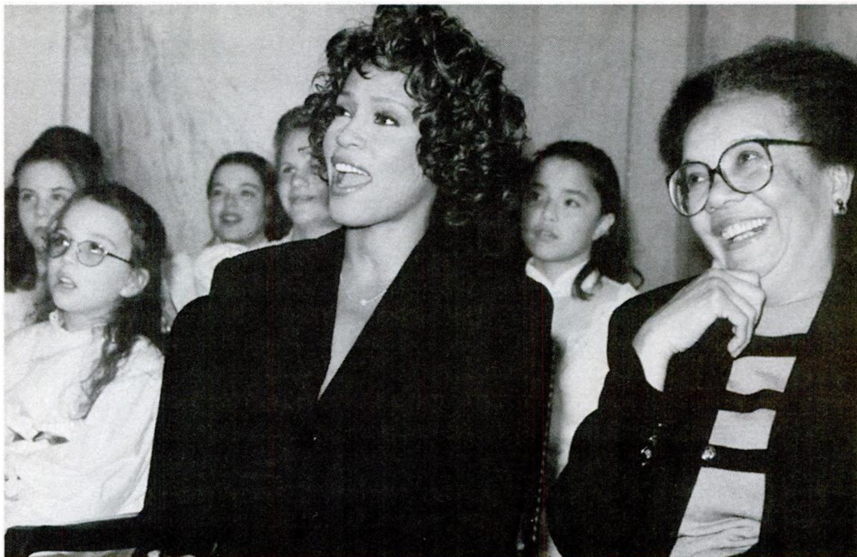
▲ Whitney Houston and Children's Defense Fund founder Marian Wright Edelman enjoy festivities surrounding the announcement of the concert that raised funds for the CDF.

ity and disabled children, said that the benefit concert was a "wonderful way to launch the 25th anniversary of the CDF."